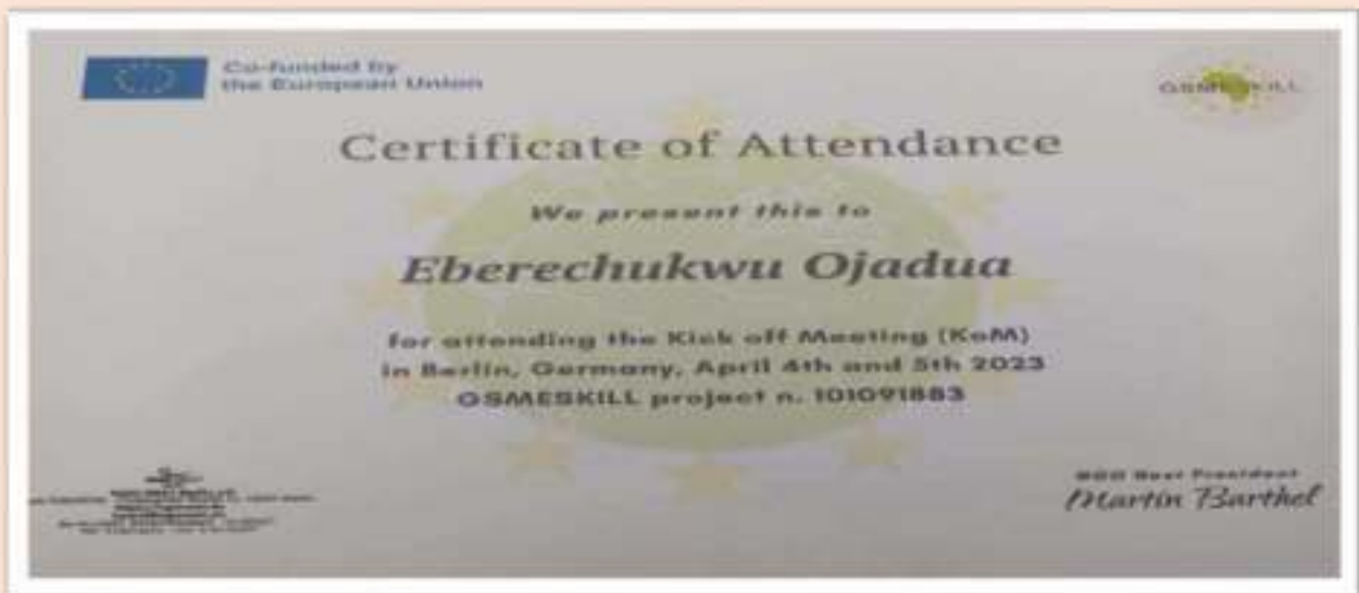
Certificate of Attendance given to the Executive director for the kickoff in Berlin Germany

More pictures from the Kickoff and project can be seen at the GSMESKILL facebook page - GSMESkill Project | Facebook